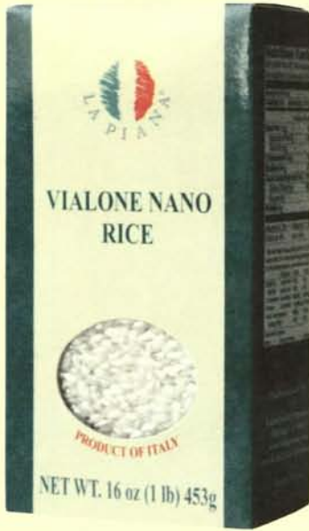
La Piana® Vialone Nano Rice