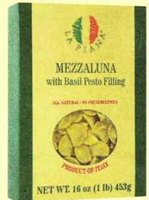
La Piana® Mezzaluna with Basil Pesto Filling