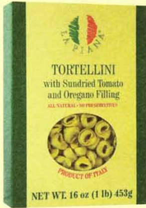
La Piana® Tortellini with Sundried Tomato and Oregano Filling