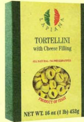
La Piana® Tortellini with Cheese Filling