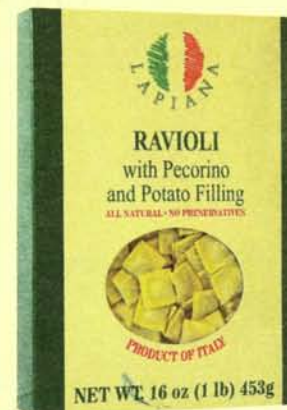
La Piana® Ravioli with Pecorino and Potato Filling

La Piana® all natural stuffed pastas are made with care in Northern Italy by a family-run business using wholesome ingredients and age-old Italian culinary techniques passed down from generation to generation.