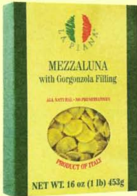
La Piana® Mezzaluna with Gorgonzola Filling