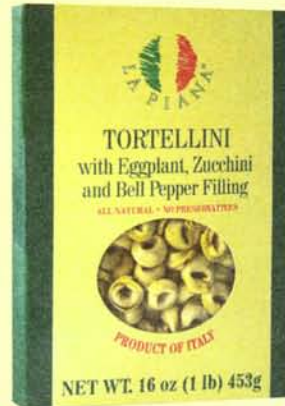
La Piana® Tortellini with Eggplant, Zucchini and Bell Pepper Filling